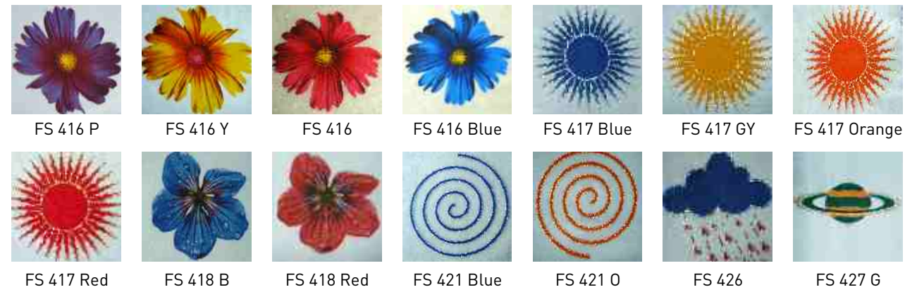
FS 416 P FS 416 Y FS 416 FS 416 Blue FS 417 Blue FS 417 GY FS 417 Orange FS 417 Red FS 418 B FS 418 Red FS 421 Blue FS 421 O FS 426 FS 427 G